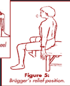
Figure 5: Brügger's relief position.